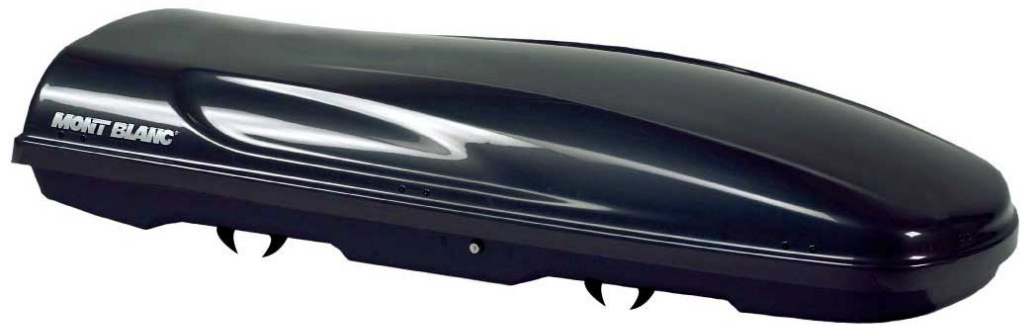
TRITON 650+ Black metallic

The box opens easily from both right and left hand side, which facilitates both the fitting and the loading and reloading.